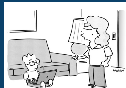
“Here’s what you’re going to do. You’re going to give those 3 million people their credit card numbers back and you’re going to say you’re sorry.”